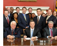
Maryland Governor O'Malley signing health care expansion. http://www.healthcareforall.com/HTML1.phtml

Maryland –A Medicaid expansion was approved November 19th by the Maryland Legislature that will result in Medicaid coverage for 100,000 additional Maryland residents. Maryland moved from having one of the lowest adult Medicaid eligibility levels in the country (hovering around 40% of the Federal Poverty Level) to covering adults up to 116 percent of the federal poverty level. Implementation of the coverage depends on the success of a ballot measure allowing slot machines.